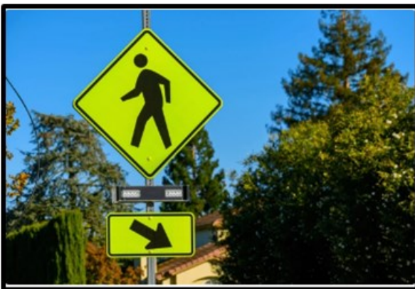
Example of Pedestrian Crossing RRFB Sign

We expect this exciting new project to be complete in the first quarter of 2025.