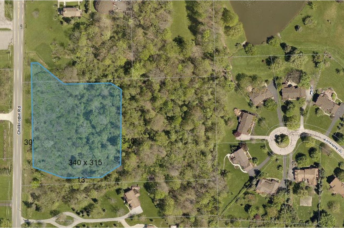
5249 Chillicothe – 2013 Aerial Overlay