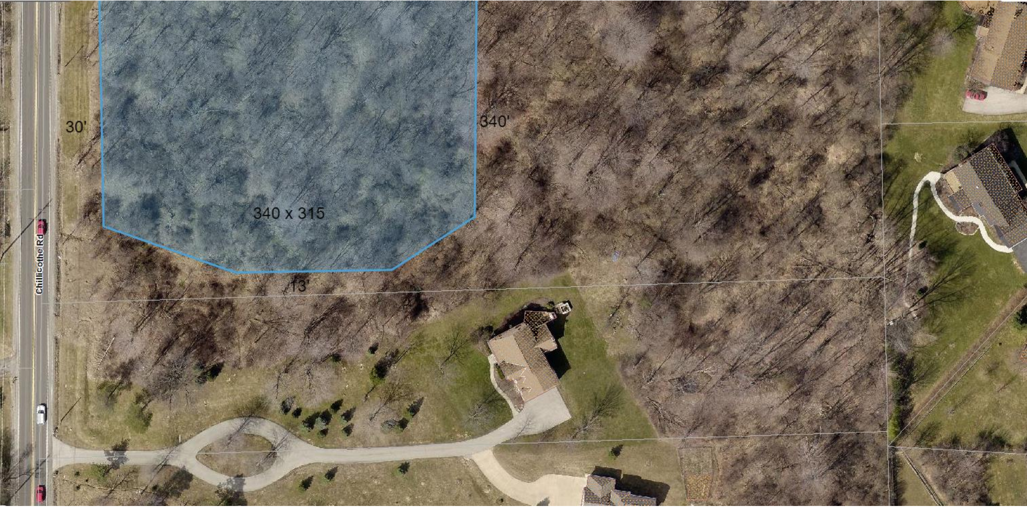
5249 Chillicothe – 2017 Aerial Overlay showing 25' encroachment of lawn and garden